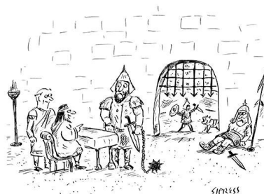
"You've been traded to Carthage for two third-round picks and a hippopotamus."

Then, we can be thankful together...as I am for all of you.